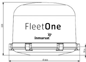
Fleet One Above Deck Unit (ADU)